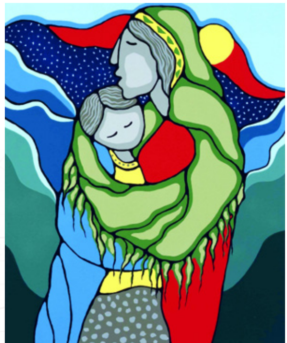
Enfolding, 1992 © Daphne Odjig, 1919-2016. Used with permission.